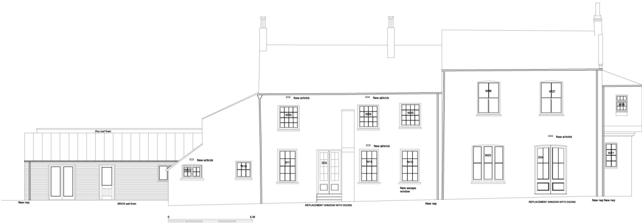
Elevation C - C

Rev. F 16.03.18 APD 10 Elevations amended Rev. E 27.11.17 Elevations amended Rev. D 01.11.17 Elevations amended Rev. C 30.08.17 App 10 added Rev. B 08.08.17 Air bricks and additional ramps added Rev. A 21.07.17 Boiler Flue added